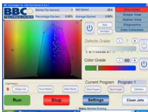
The user interface has been designed with simplicity in mind